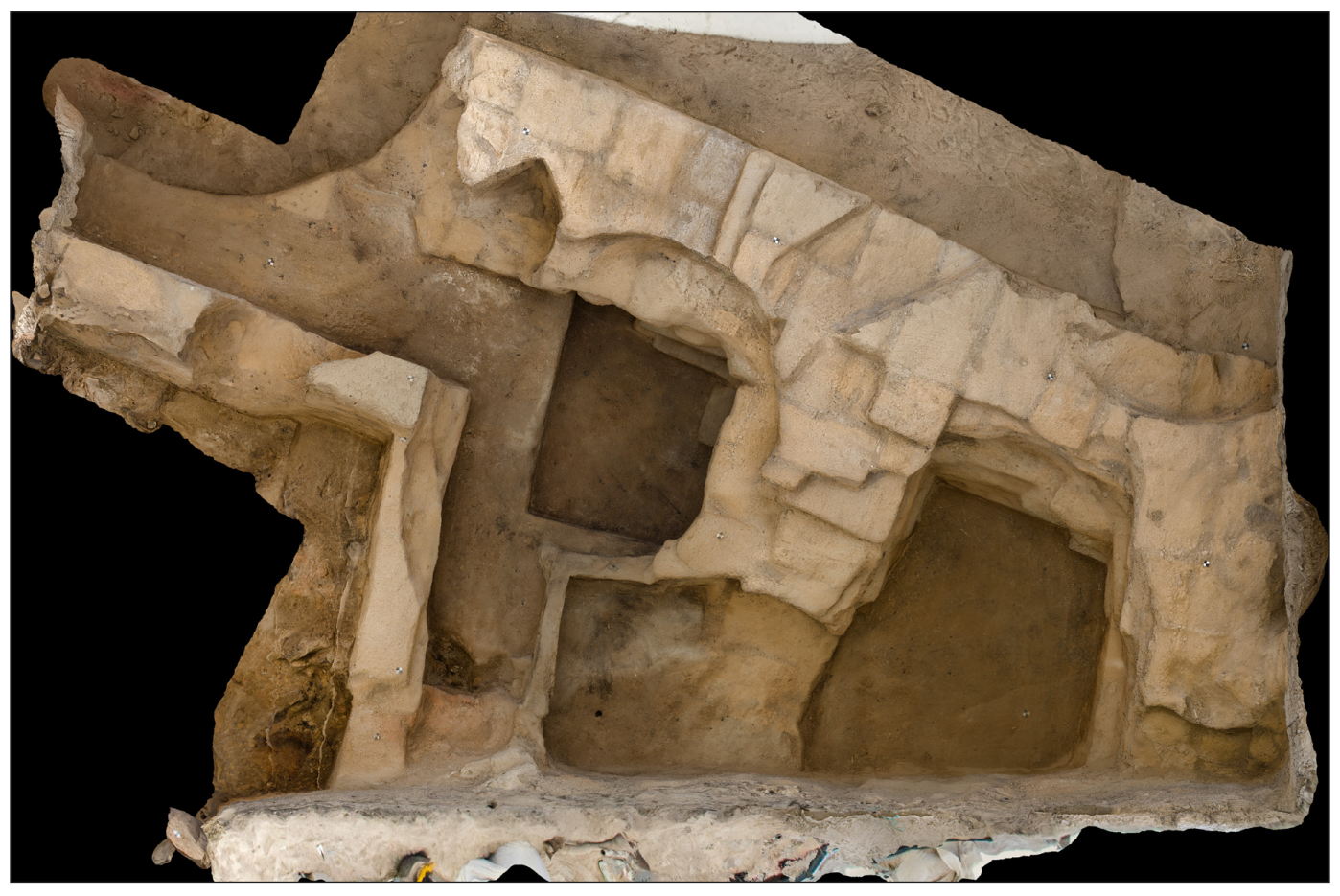
Figure 9. B.152: An orthophoto of the remaining walls, Trench 4.

Following the abandonment of B.150, as marked by a number of fill deposits (Sp.493), another Neolithic building (B.152) was constructed. Some elements of this structure were partly unearthed in the 2015 year (see Marciniak 2015; Marciniak et al. 2015). The excavations of B.152 were completed this year. The building can only be partially reconstructed, as its southern part is outside the limit of excavation. Its northern part is made of three small rooms serving unspecified purposes. Neither floor nor any inbuilt structures have been recorded. The relationship between these two superimposed dwelling structures has been established. They mark a major reconstruction of earlier B.150 and the beginning of a new type of dwelling structure characteristic of the latest Neolithic occupation levels at Çatalhöyük.