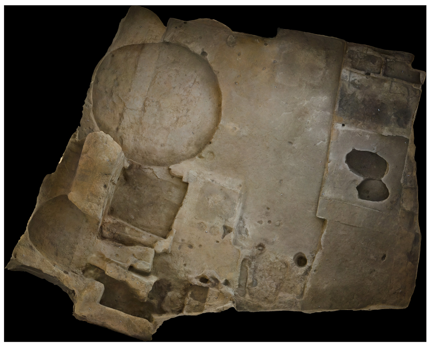
Figure 2. B.150, Sp.594: An orthophoto of the final occupational phase, Trench 4.

most substantial of them was a large oven F.8278 (Fig. 3). This is a regular, squared structure with a distinct floor and solid superstructure made of walls preserved to the height of 20cm.