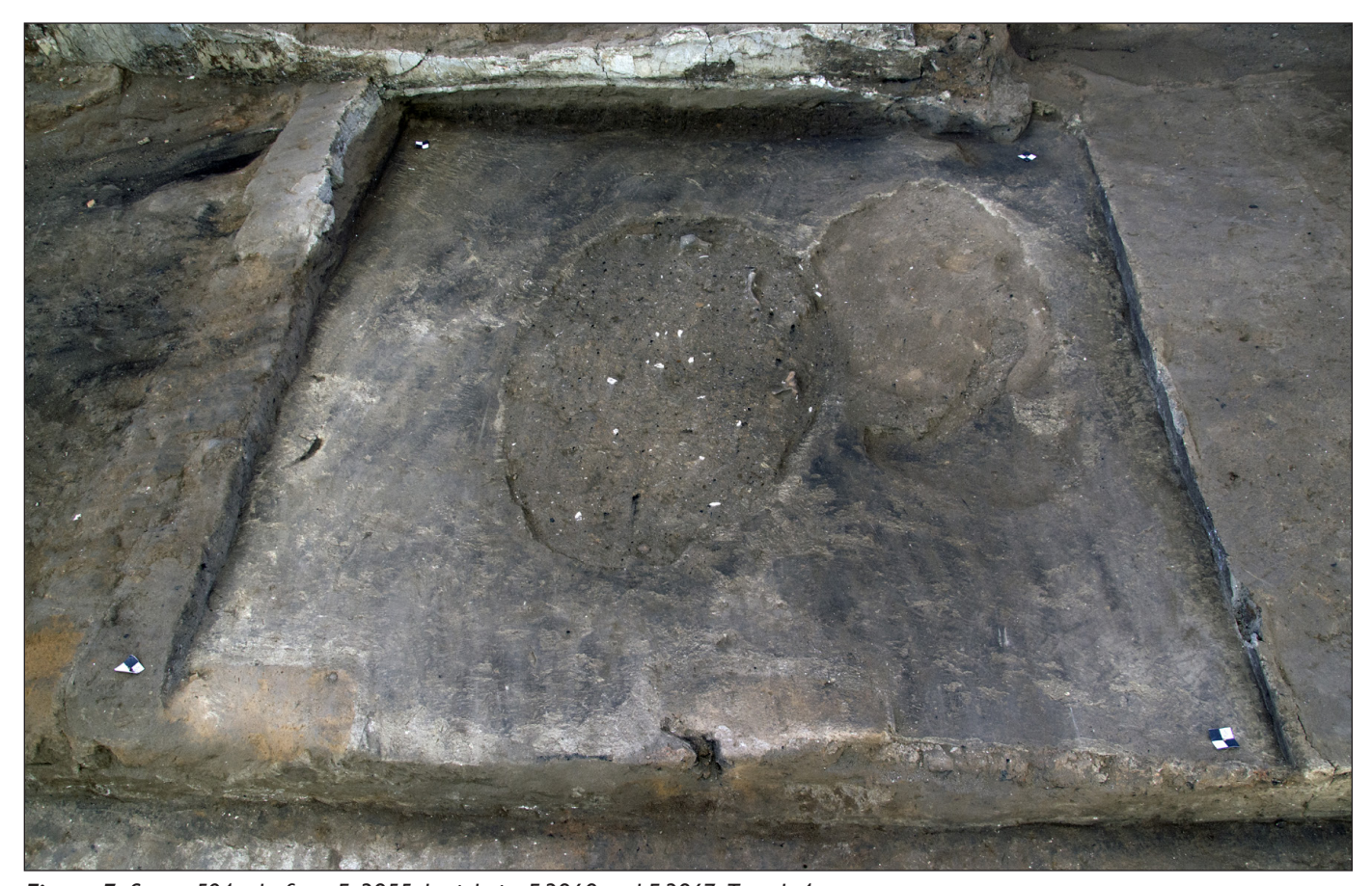
Figure 7. Space 594, platform F. 3855: burial pits F.3868 and F.3867, Trench 4.