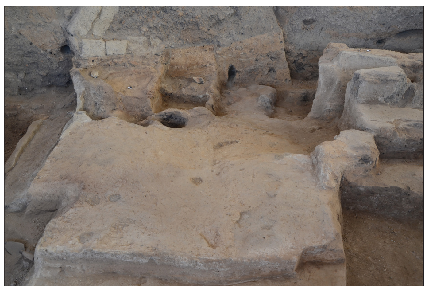
Figure 5. Space 594: platform (F.8284), Trench 4.

intensively used, as indicated by numerous reconstructions and enlargements. It involved adding outer facings to its eastern, northern and western sides. As a result of this reconstruction, the platform was enlarged towards the north. The platform was most likely built right after the construction of the latest floor (F.8276).