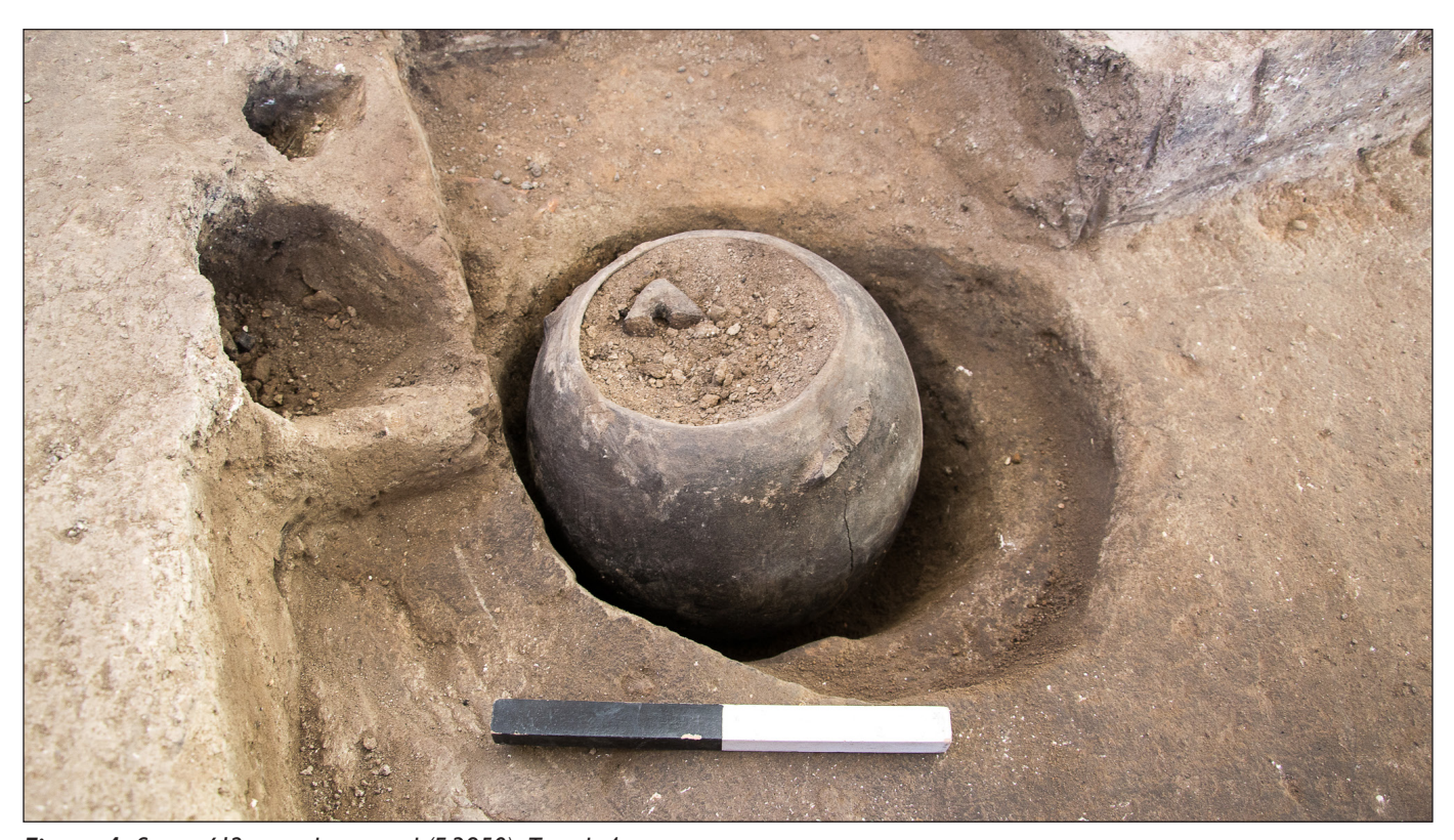
Figure 4. Space 612: complete vessel (F.3850), Trench 4.