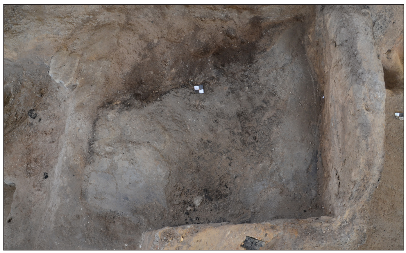
Figure 3. Space 594: oven (F.8278), Trench 4.