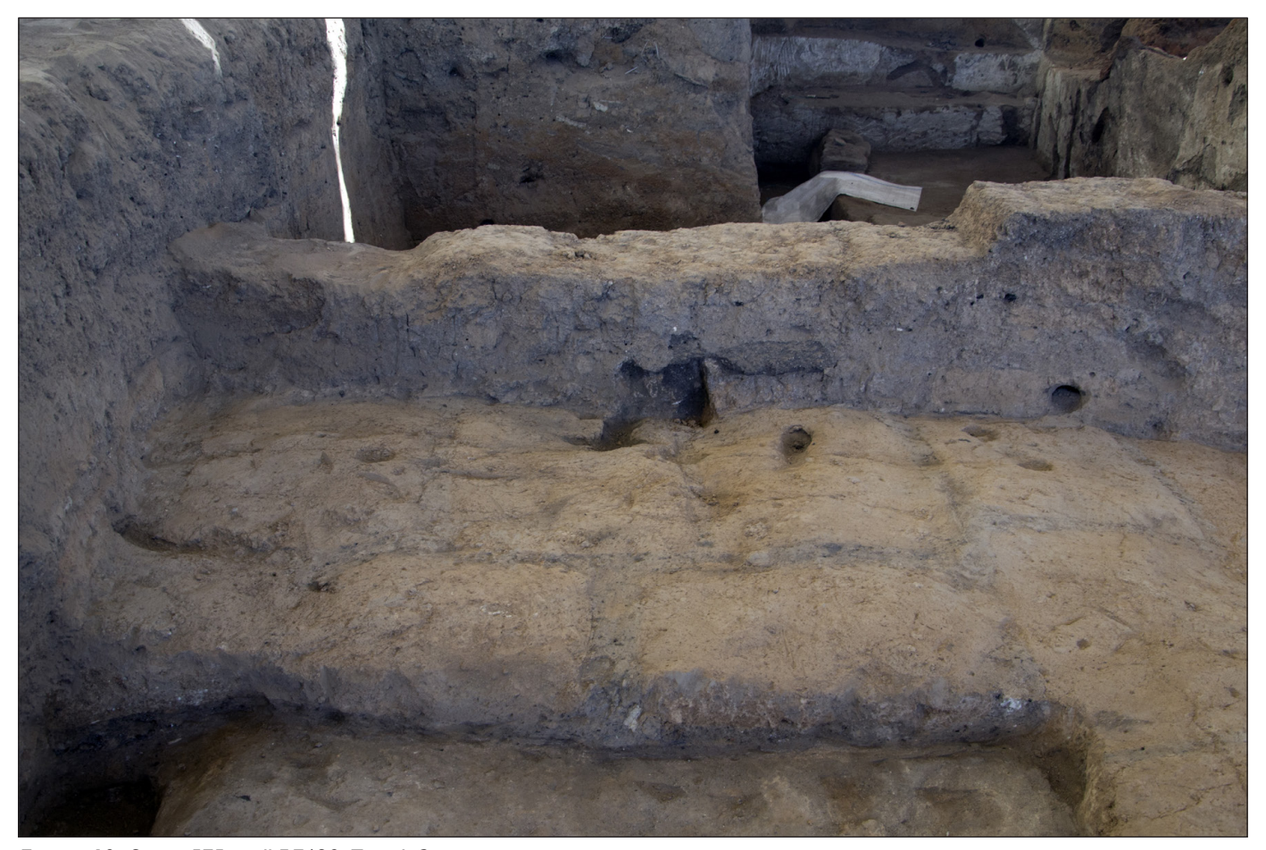
Figure 10. Space 575, wall F.7489, Trench 3.

Space 575 is located in the central-western part of Trench 3. Two of its walls F.7489 (northern) (Fig. 10) and F.3872 (eastern) are in the trench while the western wall is placed outside the limit of excavation. Directly beneath both walls, two walls belonging to earlier Sp.515 were revealed. Two of its walls: F.3878 (northern) and F.3879 (eastern) were excavated during the 2016 season. Platform F.7173, exposed in 2015 (Marciniak et al. 2013), belongs to this space.