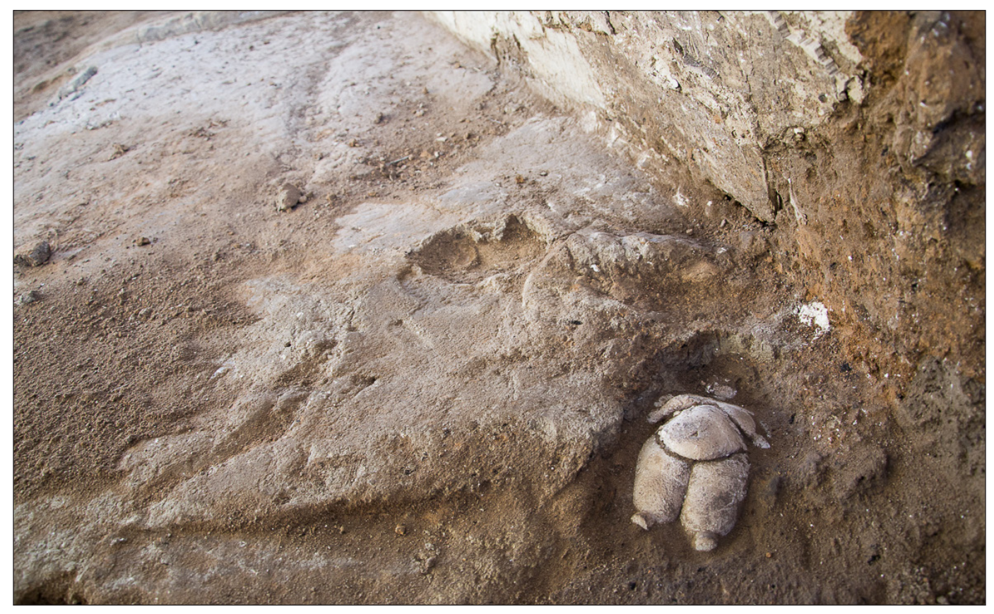
Figure 8. Space 594, platform F.3855; depositional context of marble figurine (20736.x1), Trench 4.

Building 150 is the earliest building in this part of the TPC Area. It is one of the largest houses found on the summit of the East Mound in the TP and TPC Areas. Based on its stratigraphic position and the character of its construction, the building can be tentatively dated to Level TP-M, which is