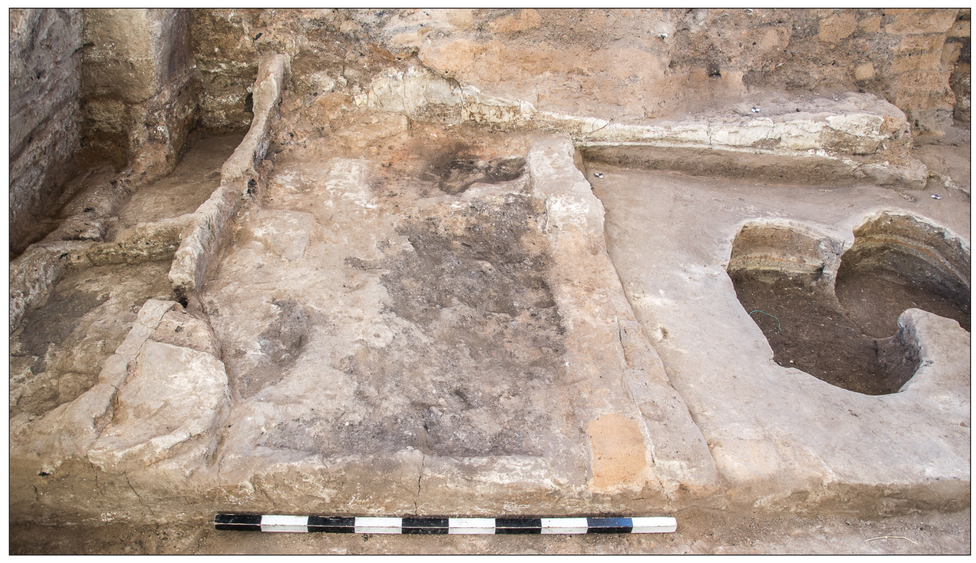
Figure 6. Space 594: platform: F. 3857; bench: F. 8298; platform: F. 8289; bench: F. 8299; and platform: F. 3855, Trench 4.